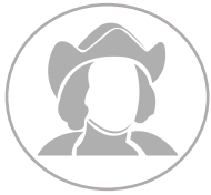
Columbus Voyage 1492