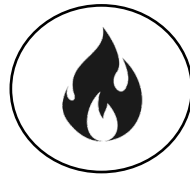
Great Fire of London 1666