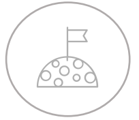
Neil Armstrong – Moon Landing 1969