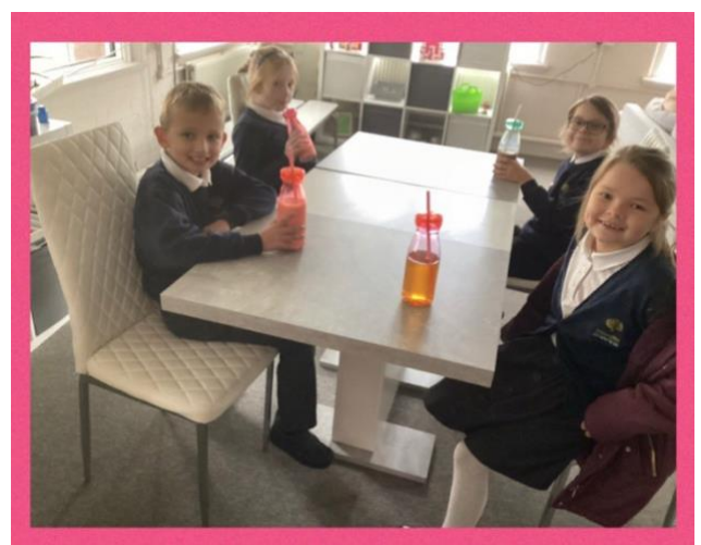
Milkshake Monday for our Y3/4 Strive for Five crew!

STRIVE FOR FIVE – We encourage all of our children to 'strive for five' and read 5 times at home during the week. Reading at home is important for every child. It is also important for our children to be read to at home – we read to the children daily at school and it is one of their favourite times of the day! Please support your child with reading at home and ensure that they bring their book to school daily.